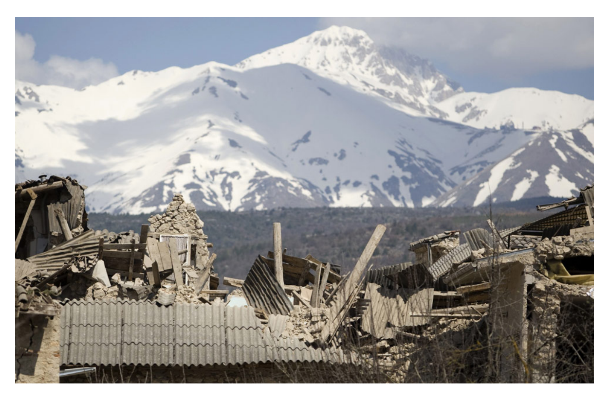
Figure 3. Shattered roofs of collapsed houses are seen against the backdrop of snow-covered mountains after an earthquake in the Italian village of Onna April 6, 2009.