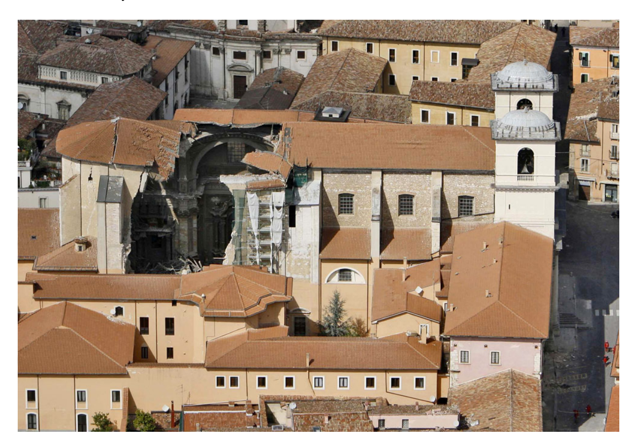
Figure 1. The Duomo Cathedral of San Massimo is seen damaged in the town center of L'Aquila, central Italy, on Tuesday, April 7, 2009.

Almost one third of this architectural heritage is located in the city of L'Aquila which, by extension, represents less than 25% of the district (CRESA, 2008). These complexes that date back to XI century, have developed and integrated harmoniously until the first half of the XX century. The heyday belongs to the period between the XIII and the XVI century.