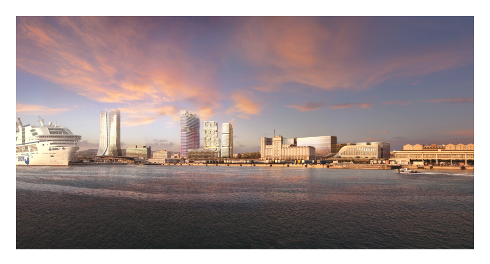
Figure 2. Marseille's future skyline. Illustration by Golem Images. Copyright: Euroméditerranée

Barcelona is conceived by the promoters of Marseille as both competitor and model. It is a much recited example, in Marseille and elsewhere, of a successful and smooth inscription in the global city market through culture-led urban redevelopment. Waterfront projects are often aimed at adding to or symbolising the "modernity" of a city, as is the case in Marseille. This drive for modernity implies that the urban landscape is the representative form through which the new economy is projected. The planned high-rise buildings, shopping facilities and cultural offers symbolise and materialise the new horizon envisioned in the modernisation of Marseille into a post-industrial, "creative" city.