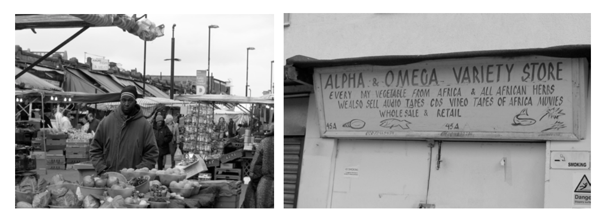
Figure 2. Fruit and vegetable seller in Ridley Road Figure 3. One of the multicultural faces of Ridley Road

social rent. The first phase of this development, including Dunbar Tower, named after Newton Dunbar (without his consent), has been completed in 2011(fig. 3).