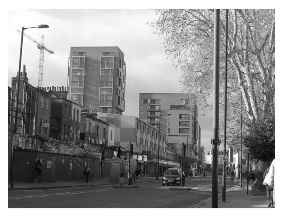
Figure 3. New developments – Dalston Square's view from Dalston Lane

When Barratts Homes – one of the largest residential property development companies in the United Kingdom – will complete the project, ten-storey blocks loom over Dalston Lane, with twenty-storey towers behind. The project includes a new bus station, cafés, restaurants and a new square. The London Borough of Hackney (London Borough of Hackney, 2009) has quoted this intervention in its Sustainable Community Strategy 2008-2018 as an example of "mixed community in well-designed neighbourhoods, where people can access high quality, affordable housing" (p. 52).