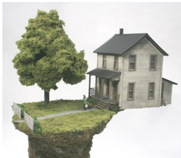
Figura 6 | Thomas Doyle, Acceptable Losses , 2008, in American Dreamers exhibition, Florence, 9 March-10 July 2012, (leaflet)