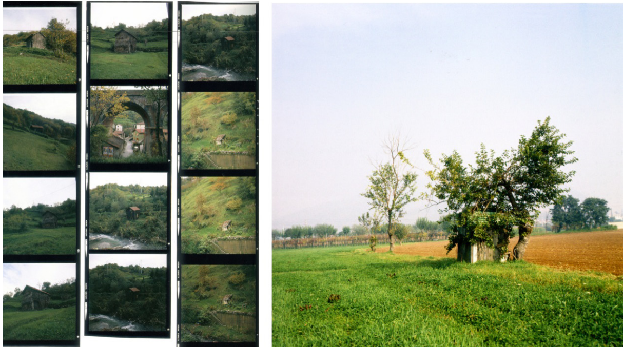
Figura 5 | Gordon Matta-Clark, 'Little Houses in Genoa, settembre-ottobre 1976', Gordon Matta-Clark, catalogue, cit., p. 126, detail.