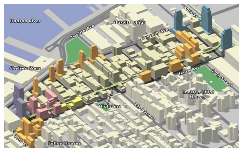
Figure 1: West Chelsea District, Highline Project, New York City.

in the Highline-case. In that case compensation is even a little more complicated because the land was rezoned so that the development rights could be sold but could also be used on site. In that case the building has to be constructed over the highline (see Figure 1).