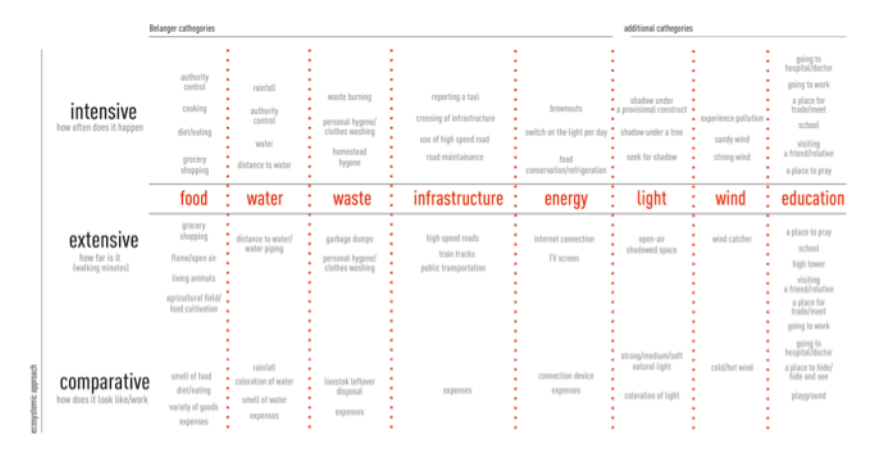
Figure 1. Ecological variables in Cairo's informal settlements (Antonia Chiesa)

(Gilbert A., 2007). Informal and spontaneous are rather the processes shaping the territory according to a performative use of space: the whole city is an exchange network system, where "fluxes of infrastructures, information technologies, energetic supply chains –such as water, power and fuel-, people and goods" (Corner J., 2006) are traceable. No longer understood as a tabula rasa upon which built forms are displaced, the broader urban context is a multi-dimensional system engaging integrated and hybridized cultural-natural ecologies (Nyamwanza A.M., 2012; Lister NM., 2010). Such state of continuous, various and even subversive transformation –so evident in the informal city- shows some reluctance to be approached traditionally. Given its complex relational nature, multiplicity and multi-layer state of continuous transformation, informal processes of urbanization resemble, and may be interpreted as, ecological processes.