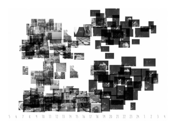
Figure 2. ToLead Nolana, image processing. The images represent the activities in the area of Porta Nolana over a 24 hour period and describe the alternation and overlapping between commercial activities, leisure activities and meetings, together with the "incursions" of tourists. The representation is part of the analysis conducted to design a blog about the inhabitants of Porta Nolana aimed at reestablishing coexistence between people.