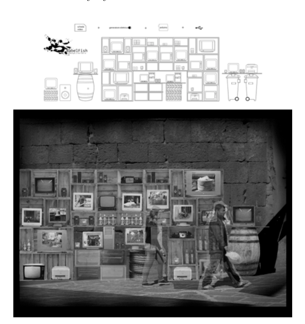
Figure 5. Babelfish, drawing of one of the possible configurations of the endogenous device.