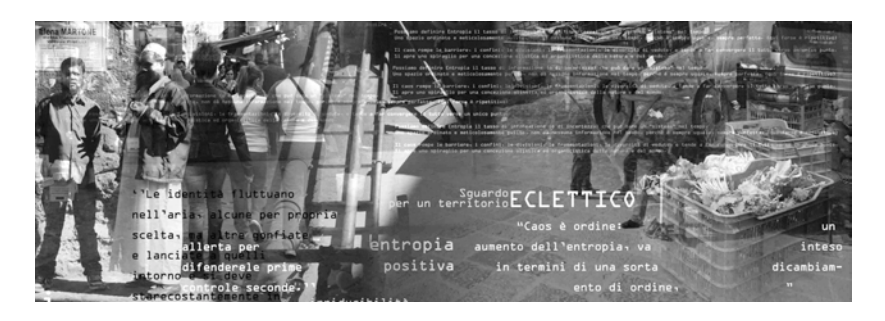
Figure 3. Babelfish, image processing. Spaces and people overlap in an alternation of uses and customs: 4.00 pm, via Sopramuro is empty, the shops are closing and while in the morning there is smell of fresh fish and the cries of fishmongers, in the evening the area is "taken over by foreigners". There's a person who says he is Sicilian to explain that women are not welcome where he is going; because it is time for prayers and he is going with other "Sicilians", dressed in his thobe, felt hat and a western style men's racket that is slightly too tight for him.

The aim is to recount this multi-faceted situation and recognise the site's vocation. It is a situation that is chaotic and stationary, surreal and iconic, stratified and anarchic, conspiratorial and circumstantial, multi-ethnic and a linguistic melting pot, supportive and marginalising ... this existential space has been the subject of narratives in a context where individual 'stories' have taken on a special significance and the biographical approach [14] has become a consolidated method.