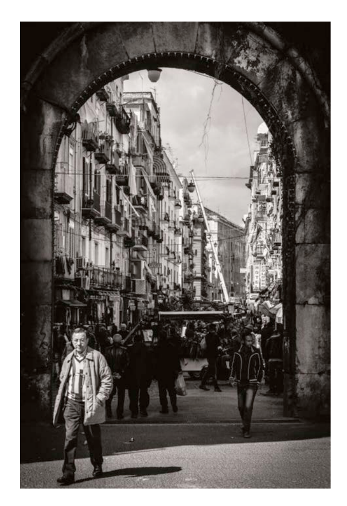
Figure 1. Naples. Porta Nolana. April 2013